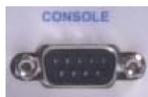
9600 bps / 8 / None / 1 / Hardware